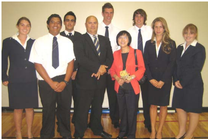
Student leaders with Tau Henare and Pansy Wong