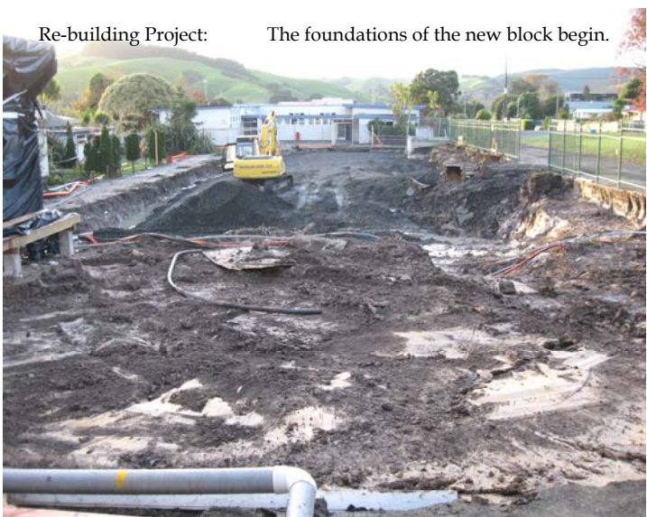
Re-building Project: The foundations of the new block begin.