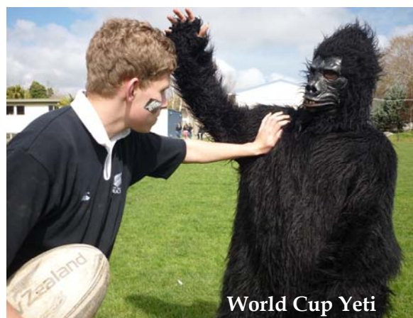
World Cup Yeti