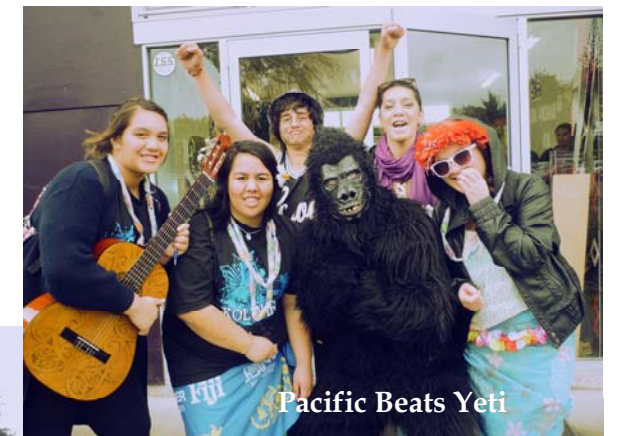
Pacific Beats Yeti