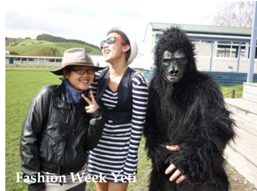
Fashion Week Yeti