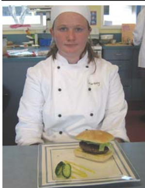
Top Junior Chefs Show Their Skills